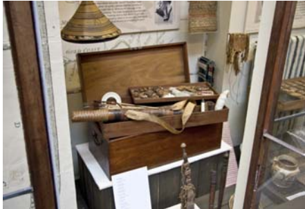
Thomas Clarkson's chest