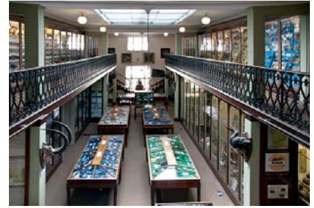
Inside the Wisbech & Fenland Museum